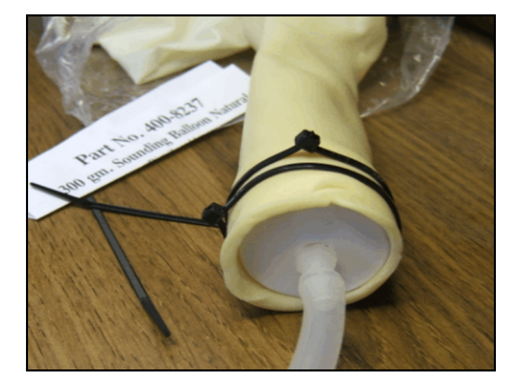
Insert the PVC Cap into the balloon Then secure with cable ties, for an air tight fit Now You can Easily fill the balloon.