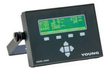
The ResponseONE <sup>TH</sup> is compatible with a broad range of data loggers and displays, including the YOUNG Model 26800 Translator.

C E complies with applicable CE directives.