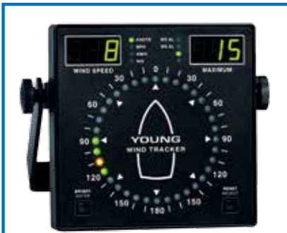
The Response ONE™ is compatible with a broad range of data loggers and displays, including the YOUNG Model 06206 Marine Wind Tracker.