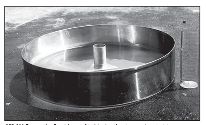
255-200 Evaporation Pan (shown with stillwell and replacement graduate)

255-200 Class A Stainless Steel Evaporation Pan