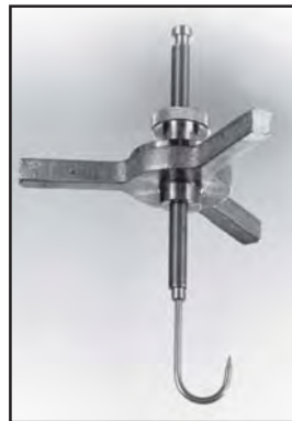
255-214 Hook Gauge

The U.S. National Weather Service standard evaporation and climatological station requires daily observations to collect the data; thus, it is not suitable for remote, unattended locations. The recommended layout of the plot and instruments for a station in the northern hemisphere is shown in the diagram. The 16' x 20' plot is the minimum for the equipment shown. Accessories such as a rain gauge wind screen would require enlargement of the plot to 20' x 20'. This station should be installed on a sod surface where obstructions are no closer than 4 times their height. Shadows should not fall on the evaporation pan except for brief periods at sunrise and sundown. NovaLynx can provide the instruments to satisfy U.S. National Weather Service requirements.