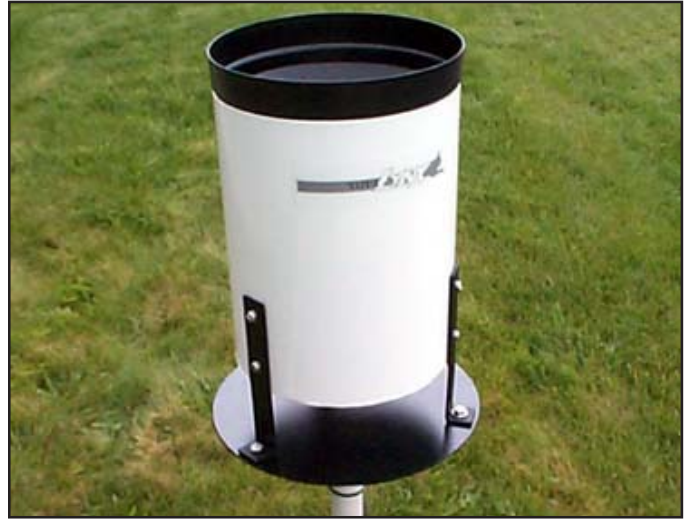
260-2501 Rain Gauge with 260-950 Mounting Plate

The Model 260-952 Rain Gauge Wind Screen minimizes the formation of strong updrafts that can distort the trajectories of precipitation particles falling toward a gauge. The screen also generates turbulent air motions over the gauge orifice to break up streamlines and thus improve the catch. Use of a wind screen is recommended with all precipitation gauges located in windy areas. The screen consists of 32 free-swinging metal leaves, evenly spaced around a 48" diameter. Each leaf is fabricated from 20-gauge galvanized sheet metal, 16" long, 3" wide at the top and 2" wide at the bottom. One of the quadrants swings out to permit easy access to the gauge. Two lengths of legs (2' and 3') are available due to variations in gauge height. A mounting kit is available for mounting to a wooden platform.