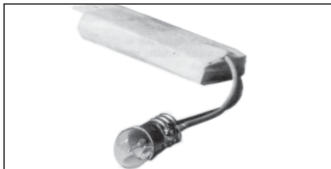
400-8318 Pilot Balloon Light (no longer available)