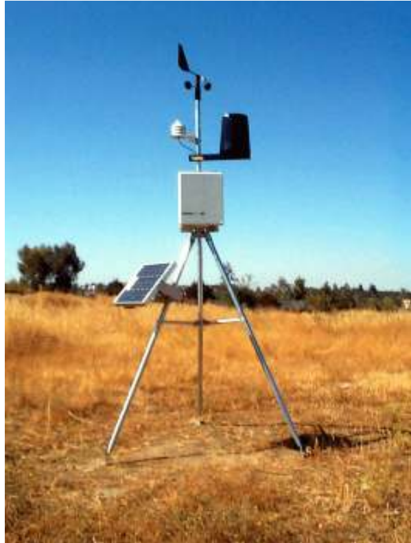
110-WS-16 Modular Weather Station with NEMA-4X Enclosure & Solar Panel