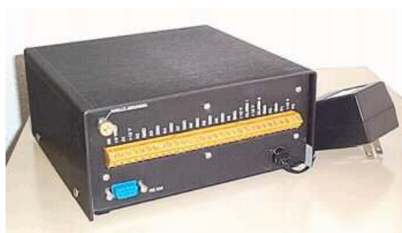
110-WS-16D Data Acquisition Module & 110-WS-16P Power Pack