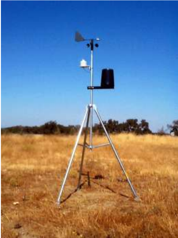
110-WS-16 Modular Weather Station (Data Acquisition Module shown below)