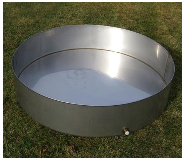
255-200 Evaporation Pan

255-200 Evaporation Pan 255-210 Stillwell with Fixed Point 255-211M Replacement Graduate, Metric 255-212 Floating/Submersible Min-Max Thermometer °C 200-2511-B Totalizing Anemometer, kilometers