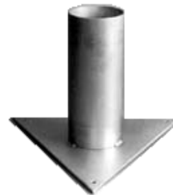
255-205 / 255-210 Still Well