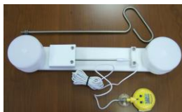
255-212 Floating/Submersible Min-Max Thermometer

A floating/submersible Min-Max thermometer monitors the water temperature in the pan. A short cable links the thermometer to a waterproof digital display.