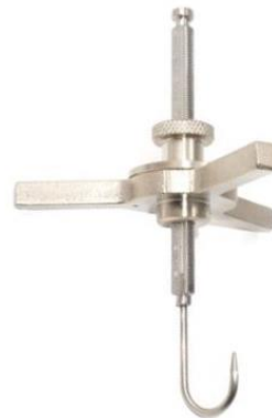
255-214 Hook Gauge

The 255-205 Still Well is placed in the evaporation pan and serves as a support for the hook gauge when measurements are taken. The hook gauge is adjusted until the point just breaks the water surface, and a reading is taken from the attached scale.