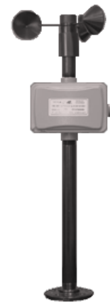
200-251x-B Totalizing Anemometer

Group 255 Stations include a totalizing anemometer to measure wind run in miles or kilometers. The sensor is mounted on the same platform as the evaporation pan.